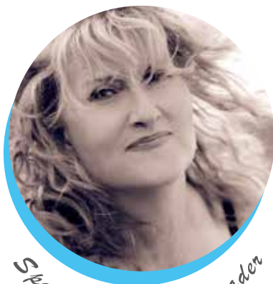
Sponsors of Eddi Reader