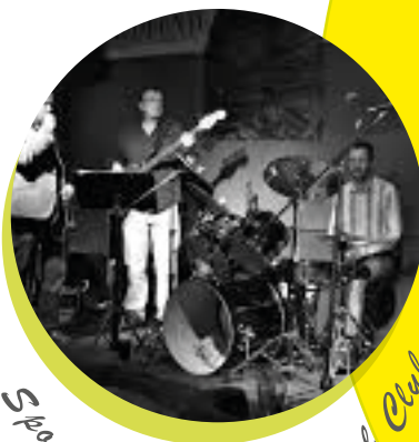
Sponsors of The Festival Clubs

Biggar Little Festival can only happen with the generous support of local businesses and individuals providing financial support by way of sponsorship. We are extremely grateful to all our sponsors.